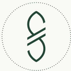
The SEEDS currency symbol

Seeds (the currency) is an evolution in money, establishing new expectations for what currency can do for society.